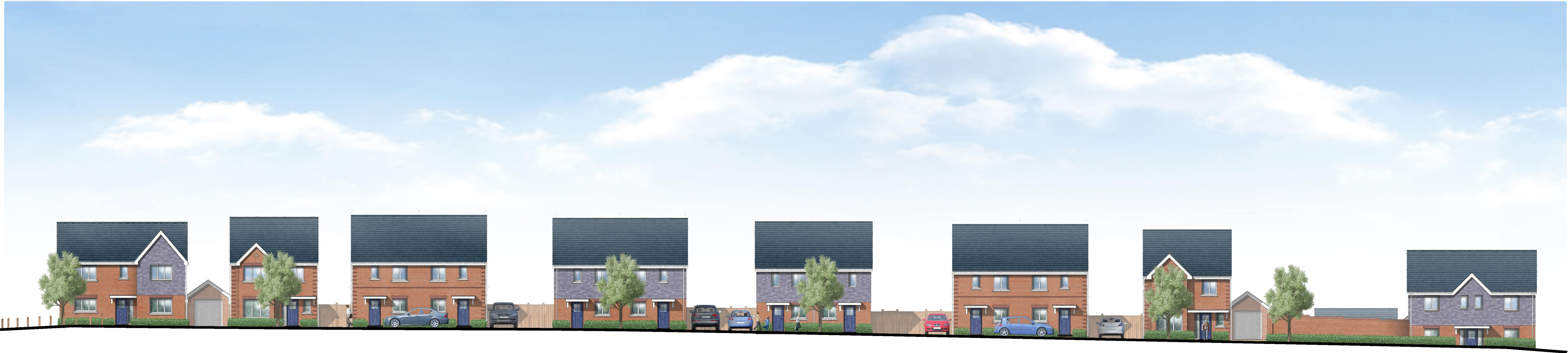
House Type Milliner Plot 80 House Type Scrivener Plot 79 House Type H30 Plot 78 House Type H30 Plot 77 House Type H30 Plot 76 House Type H30 Plot 75 House Type H20 Plot 74 House Type H20 Plot 73 House Type H30 Plot 72 House Type H30 Plot 71 House Type Scrivener Plot 70 House Type Bowyer Plot 67

NOTE: Ground levels and finished floor levels are indicative only and subject to engineers' detailed design.